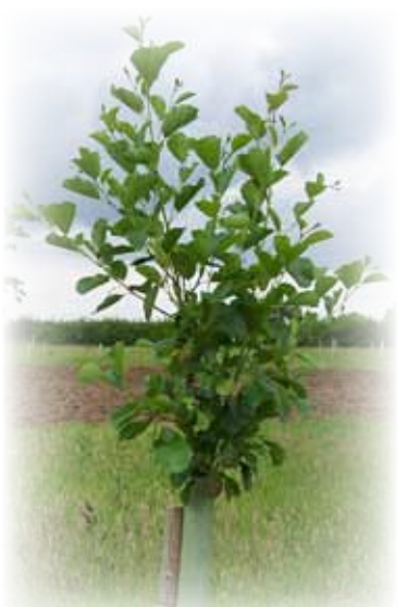
TREES Over 450 trees have been planted, these range from the old established Oak and Ash to the more exotic Medlar and Lady Henniker Apple.